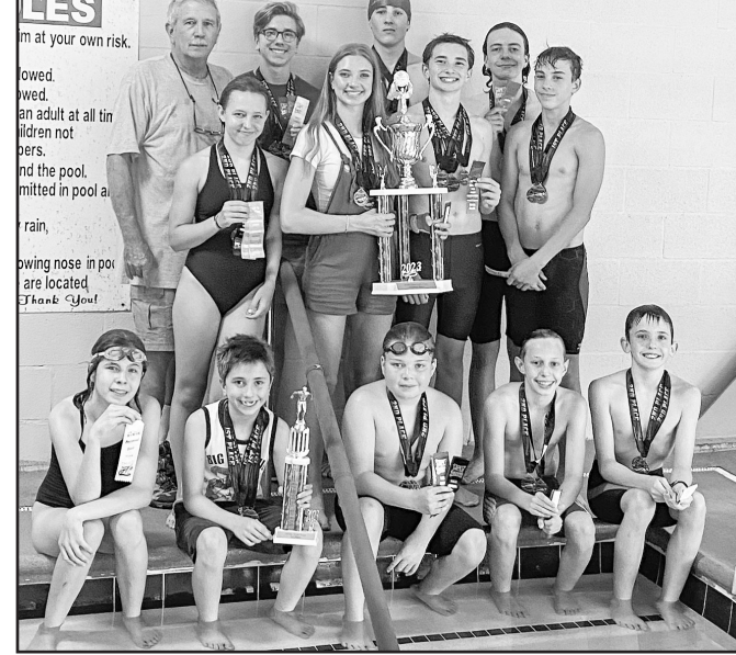
The North Georgia Rapids Swim Team. tributing to the team's success