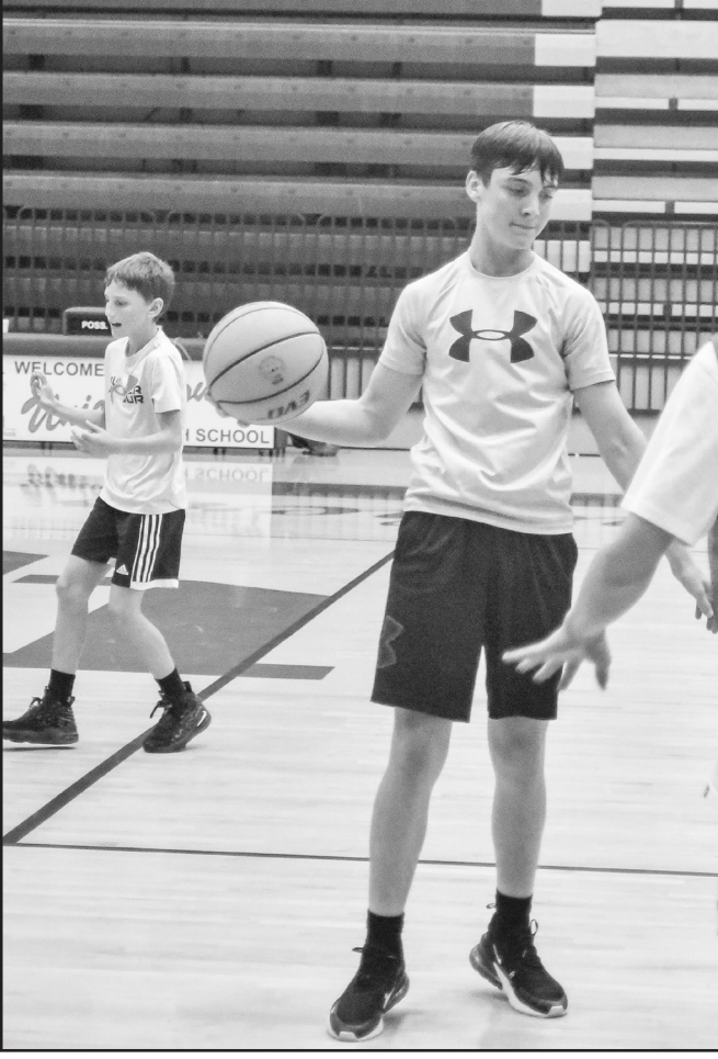
Fun and fundamentals were the primary objectives of last week's UCHS boys youth basketball camp.